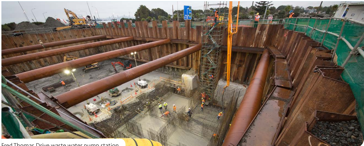
Fred Thomas Drive waste water pump station

You can read about our progress, expenditure, service performance and challenges faced in 2018/2019. It's of the wider annual reporting package for the Aucklar Council Group and meets our Local Government Act obligations to report on our performance against agree measures. It also reports against the council's Long-te Plan 2018-2028 (10-year Budget 2018-2028) and th Devonport-Takapuna Local Board Agreement 2018/2 This report also reflects the local flavour of your area profiling its population, people and council facilities. features a story about a council or community activit adds special value to the area and demonstrates how together we're delivering for Auckland.